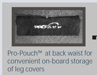
Pro-Pouch™ at back waist for convenient on-board storage of leg covers